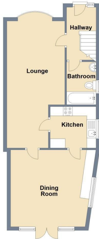
Ground Floor Approx. 52.6 sq. metres (566.7 sq. feet)